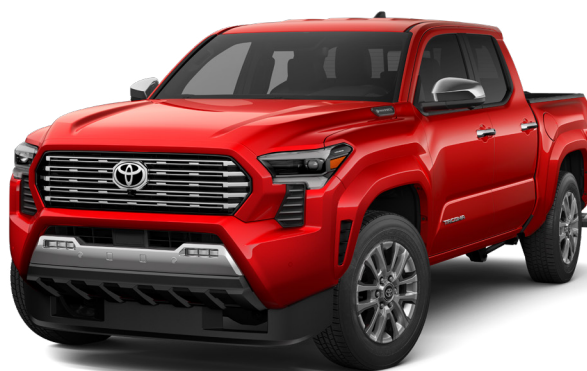
Limited shown in Supersonic Red. Premium paint charge.