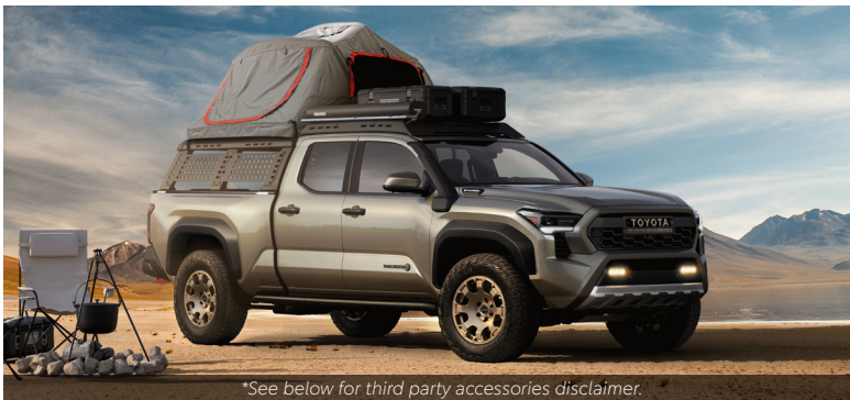
*See below for third party accessories disclaimer.