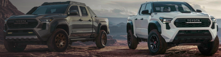
TRD Pro shown in Ice Cap with Black roof. Premium paint charge.

The 2024 Toyota Tacoma is here and ready to take the mid-sized truck segment by storm. It has been the leader in this segment for almost two decades and will continue to keep its place at the top. This 4th generation embodies "Rugged Sophistication," enhanced off-road capability, and offers hundreds of options for customers to choose from—there truly is a Tacoma for everyone.