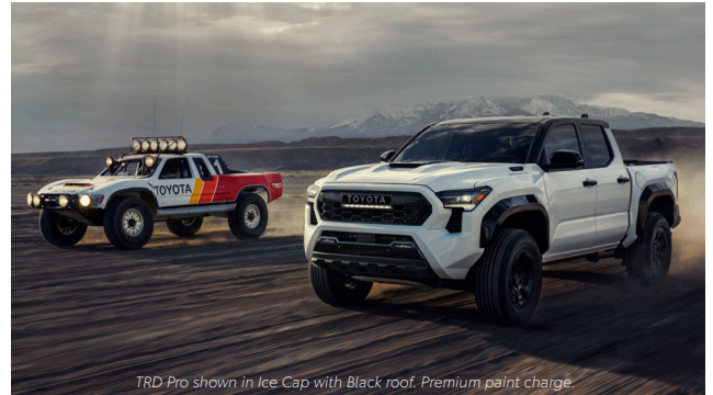
TRD Pro shown in Ice Cap with Black roof. Premium paint charge.

This off-road performance knit into the Tacoma's DNA is expressed with the essence of Tacomaness-- a high-lift, big tires, slim body, and a powerful athletic stance that pays homage to its desert racing roots.