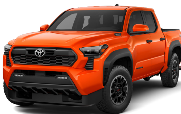
TRD Off-Road shown in Solar Octane. Premium paint charge.