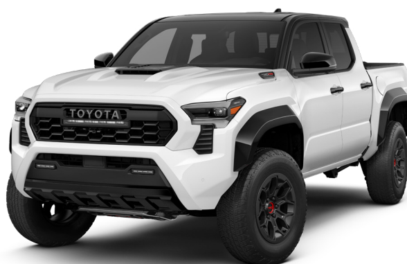
TRD Pro shown in Ice Cap with Black roof. Premium paint charge.